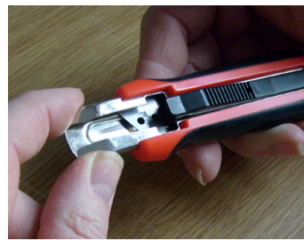
6. Release slider & check operation.