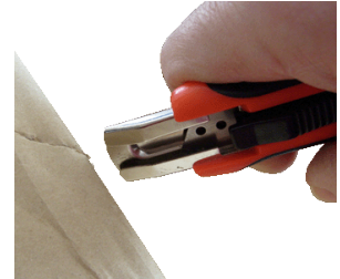
On exiting cut blade auto retracts