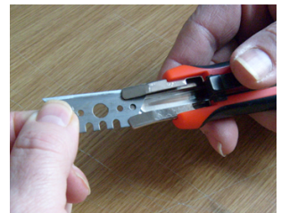
4. Slide new blade into guide of the old blade (shown as Inverted for Left Hand Use)