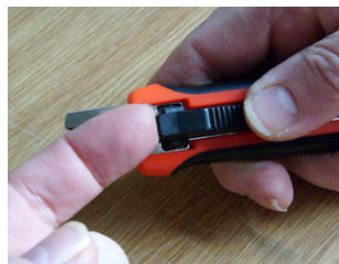
2. Lift Slider away from blade