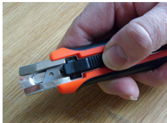
1. Align slider with cut outs in blade guide

Blade life will depend on the type of product being cut and the frequency of use, consideration for a daily blade change should be given for a knife in frequent use. Blade changing is a simple process, requiring no tools