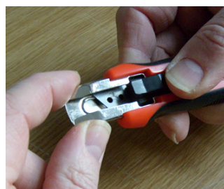
5. Align slider with cut outs and hole in blade ensuring location