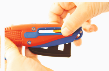
6 Reposition the wheel to position 3 (operating position) the knife is ready to use!