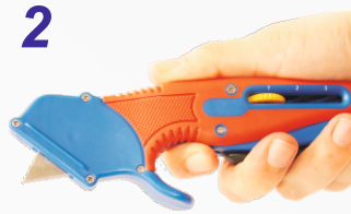
2 Fully press the trigger with one hand .