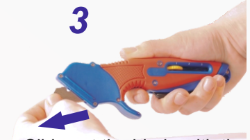
3 Slide out the blade with the other hand & discard safely.