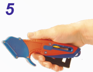
5 Once the blade is fully in place release the trigger.

Continue to keep the trigger depressed while you insert the new blade, the bottom edge of the blade must be kept parallel with the bottom edge of the head ensure the blade is pushed fully in.