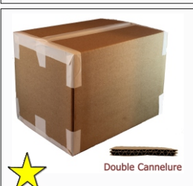
Single & double corrugated cardboard up to 8mm thick