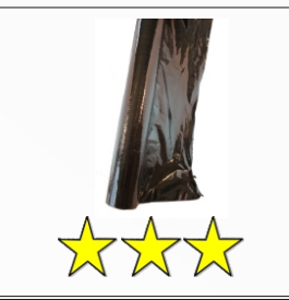
Stretch film thickness up to 30µm