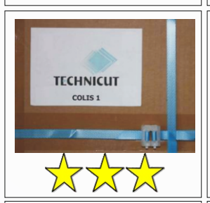
Straps, plastic foils, composites textiles