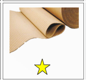
Craft & Craft paper double plastic.