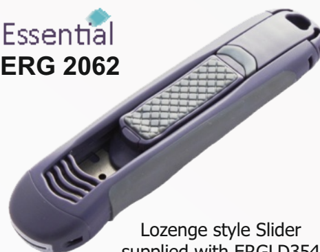
Lozenge style Slider supplied with ERGLD354 Blade and Blade Carrier