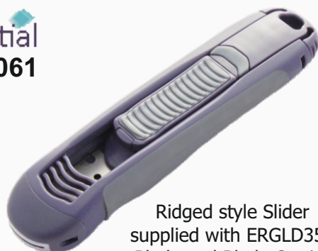
Ridged style Slider supplied with ERGLD354 Blade and Blade Carrier

Aluminium insert reduces blade erosion to the head.