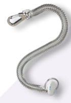
#GS1025 (11.25 in, adhesive disk)